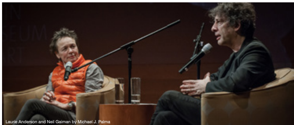
Laurie Anderson and Neil Gaiman

The boundaries of human wisdom and the state of unknowing were the focus of this conversation series. Bringing together creative thinkers from a broad range of backgrounds, the Ignorance series featured on-stage conversations, film screenings, and interactive experiences that illuminated how awareness, or lack thereof, fuels our actions, relationships, and sense of self.